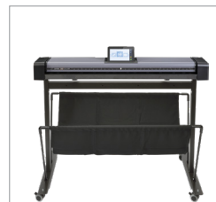
Low stand for side-by-side