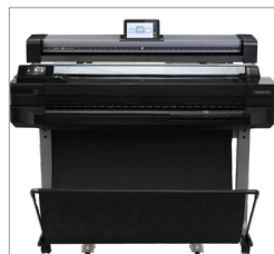
Optional high stand to place over printer.