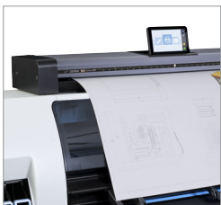
SD One MF is light enough to be placed on any flat surface like a printer.

Perfect for situations where you need to allocate costs, SD One MF has integrated print management software, allowing you to track the cost of every scan, copy or print.